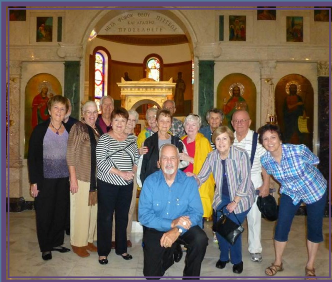
Annunciation Greek Orthodox Cathedral