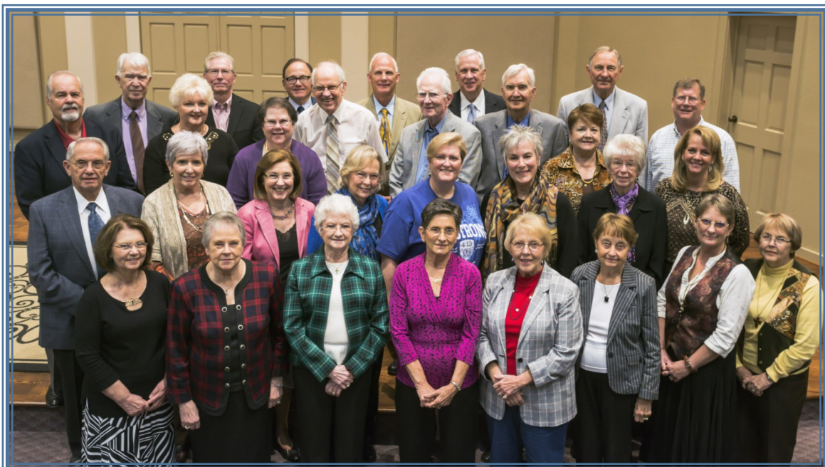
Senior Adult WBS Group Leaders

Step two: we are preparing to offer a tool in which believe we will discover the transforming power of God in us that can fill our lives with HIS thinking, HIS heart, HIS ways, and thus think less about ourselves and more about others. We will be studying the book “The Good and Beautiful God” in small groups on Sunday Nights.